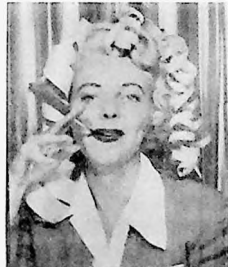
Who'll be my CherCheur on this date?