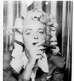
Never mind Sweetie, I'll take it myself!