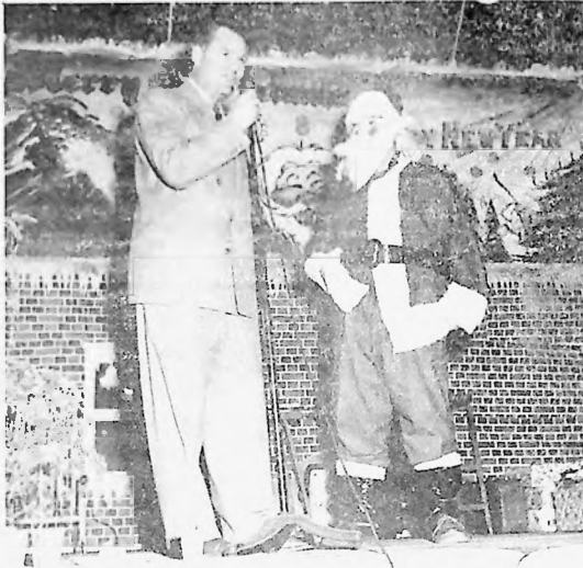
'T WAS A MERRY CHRISTMAS!