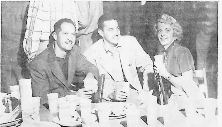
Right: The ratio of cups to people is overwhelming!!!