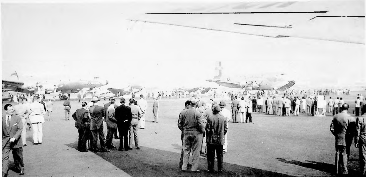
Part of the crowd of almost 3000 persons view the display at the Tiger-Slick Open House May 12.