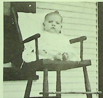
Small boy in Texas!