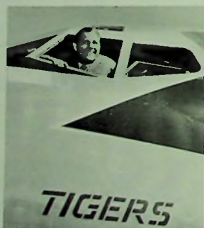
Inspecting his airline's first jet-powered freighter, above, a Boeing 707 . . . 1965.