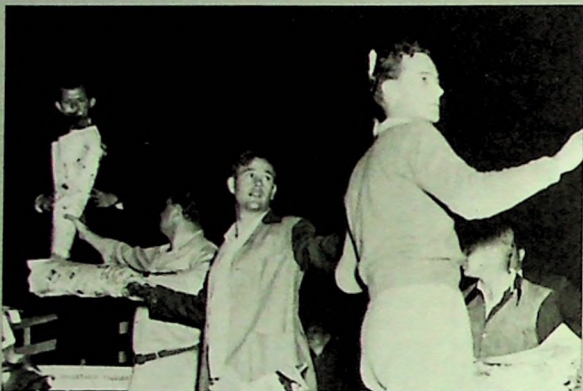
Loading flowers on board one of his freighters — a Budd Conestoga . . . 1945.