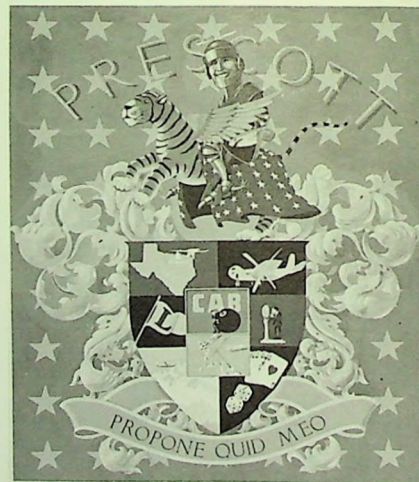
Prescott coat-of-arms: "Make me a proposition."

Besides his real love for his fellow man — his humanness — he was a man who never wasted time kidding himself about himself. He had great confidence and unlimited courage, but he never wore either on his shoulder. Yet, you always knew it was there, and it made you want to work for him; really work, to help solve the problems. Maybe his