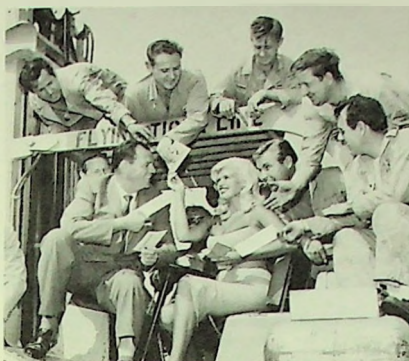
Prescott with actress Jayne Mansfield, publicizing a Flying Tigers United Way campaign.

remark during one of the airline's many crises defines Bob's approach to life: "Listen, I'll be a pioneer and a volunteer — but never a martyr."