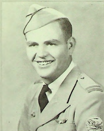
In the AVG . . . 1942.