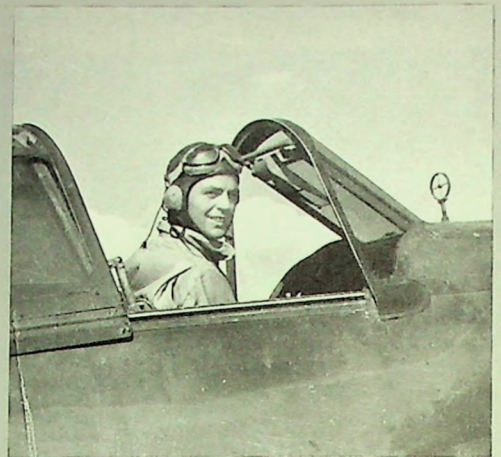
Piloting a P-40 . . . 1942.