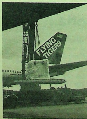
Heavy handling — A 46,000 pound piece of machinery is loaded on board a Flying Tigers jettie in Zurich, Switzerland with the help of a heavy duty crane, above and at left, for a flight to New York. Zurich Flying Tigers enjoy meeting the challenges presented by heavy and out-sized freight.