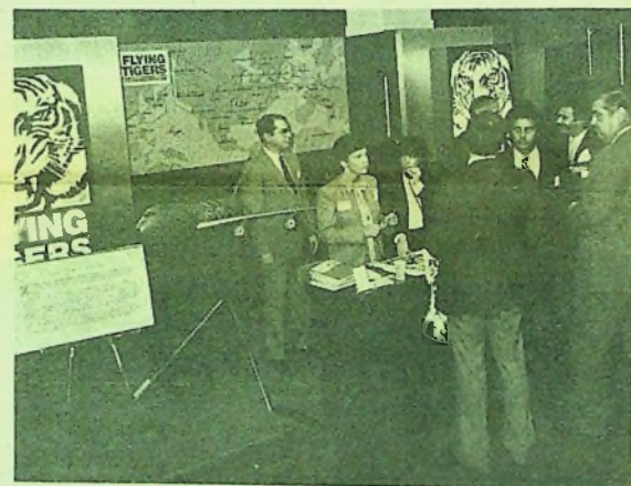
New route map was a focus of the airline's display booth at the International Air Cargo Exhibition in New York September 27-30. The booth at left, prominently displayed the airline's name, our B747 aircraft and extensive route structure. Above, Flying Tigers greet shippers, government officials and industry leaders at the exhibition.